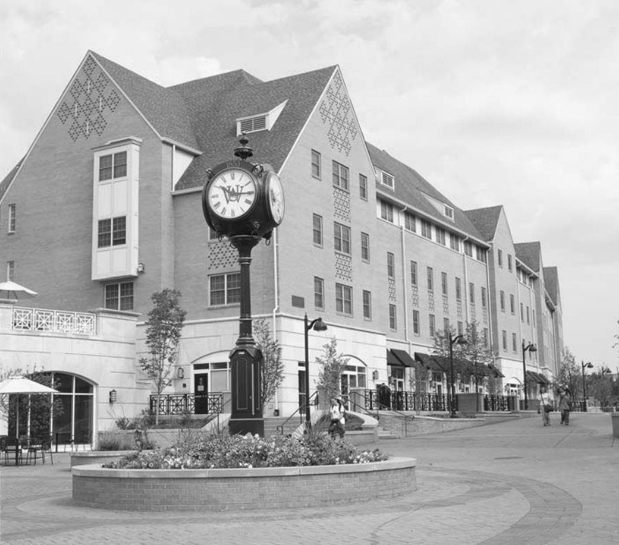
The South 40 Clock tower is a popular place for students to meet and hang out.